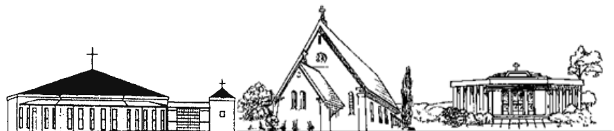
Church of the Nativity 26 Sunnymead Drive Aberfoyle Park

Let us pray for migrants, refugees, and those affected by war, that their right to an education, which is necessary to build a better world, might always be respected.